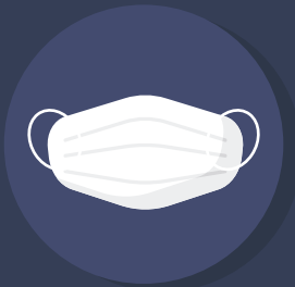
Mandatory use of the mask